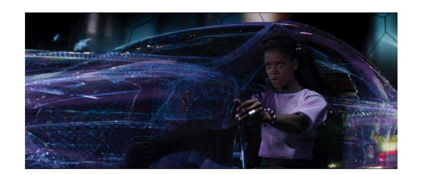
FIGURE No 2

Shuri remotely drives a car in South Korea (Smith 2022)