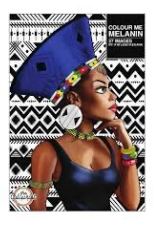
FIGURE No 3

drawings, using colours that authentically represent African women's skin tones, and to be inspired by the poetry (Figure 2). In this way, although the book does not strictly belong in the genre of speculative fiction, it gestures towards a future yet to be realised, in which Black women can enjoy their own beauty and lineages.