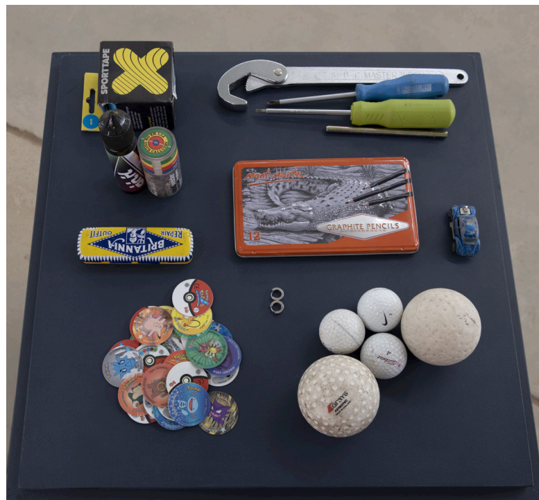
FIGURE Nº 6

Thabang Moatshe. Untitled (2021). Papercut silhouette tableau. Dimensions variable.