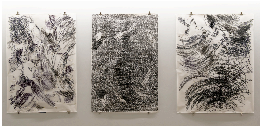
FIGURE Nº 3