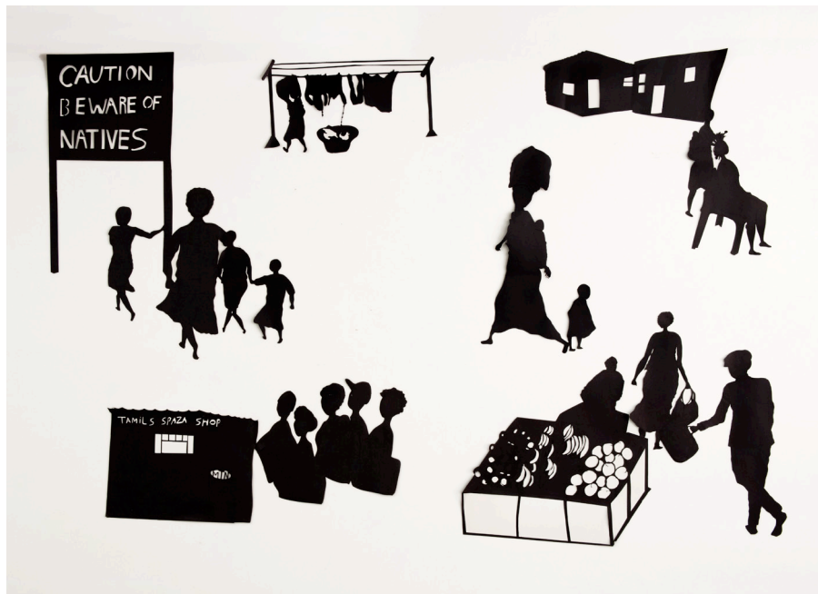
FIGURE Nº 5