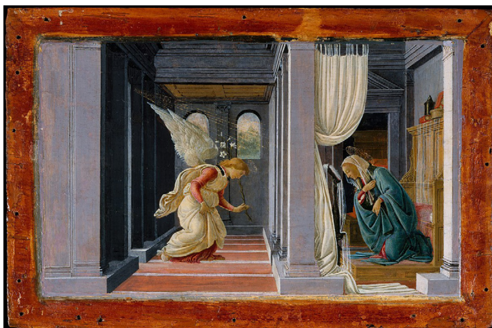
FIGURE N° 4

The punctum saliens , the leaping, striking or touching point of my argument, is the observation of the calculated separation which is mostly established between the Angel and the Virgin in Annunciation paintings, sometimes emphasised, during the Renaissance, by columns or an arch or open doorway, or even sometimes, as in Sandro Botticelli's Annunciation (1485) (Figure 4), by a seemingly impenetrable partition from the point of view of the spectator (Casey 2002:4). What I find remarkable about this deliberate evocation of non-touch in so many painted versions of the Annunciation over many centuries, is the way in which concomitantly in these same paintings, light is shown to break in on the scene in apparent compensation for the lack of contact between the Angel and the Virgin. Fra Angelico's Prado Annunciation (c.1426-1430) (Figure 5) serves as the first case in point, suggesting the blocking off of the observer, in order to open up a horizon of meaning.