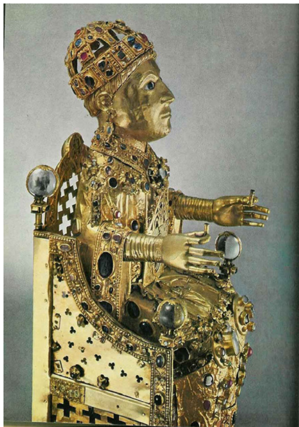
FIGURE N° 3

The traces of Skotnes's obsessive writing on and handling, working, gilding, plating, touching of the once living bones of horses make them comparable to medieval reliquaries (Greenblatt 2009:58-71), and in the context of her installations, are reminiscent of acts of commemoration in the devotional use of the rosary (Hofmeyr 2009:76-101).