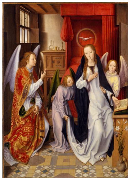
FIGURE N° 8