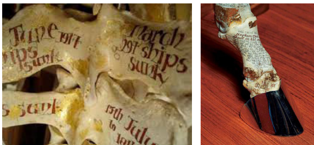
FIGURE Nº 2

Pippa Skotnes. Horse skeletons. Lamb of God installations (2004 – 2010), and The Horse. Multiple Views of a Singular Beast (2012) details, Everard Read Circa Gallery, Johannesburg. Courtesy of the artist.