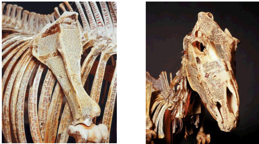
FIGURE Nº 1

as the Virgin is addressed by the Angel in some Renaissance depictions of the topos of the Annunciation. I interpret the contemporary South African artist Pippa Skotnes's horse skeletons in resonance with this constellation of Renaissance Annunciation paintings to show how artistic image objects may knowingly point to profound historical changes in attitudes towards images.