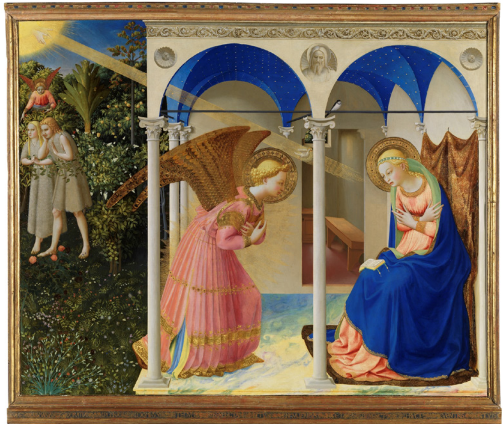
FIGURE N° 5