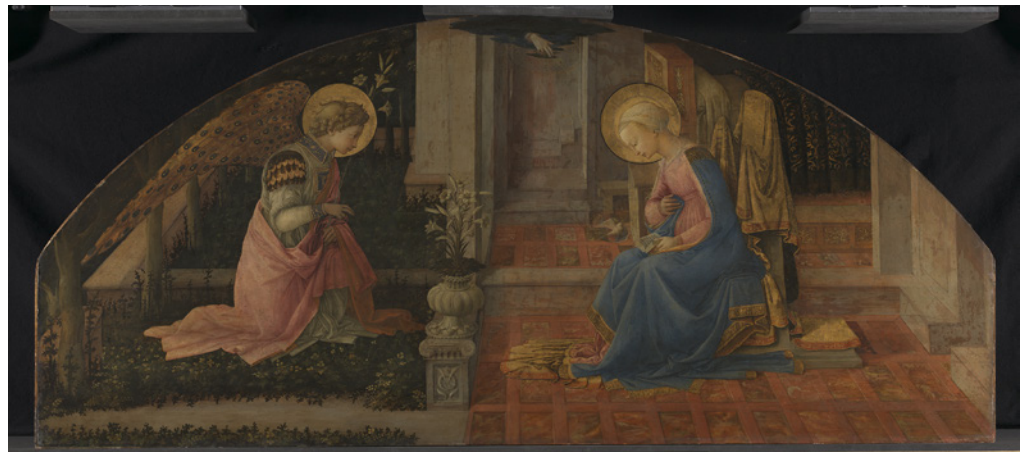
FIGURE N° 6

This, in each case, is a healing light which carries the Word of God turning into flesh. It bridges the impassable chasm between God and humankind at that moment when Christ enters the scene of human history through the Immaculate Conception and Incarnation. Like the speaking Angel, the bearer of good tidings, this redemptive light which touches the Virgin, and the Word which reaches her ears, bears the gift of salvation, thus urging the beholder to take cognisance of the oscillation between the transcendental and the visible.