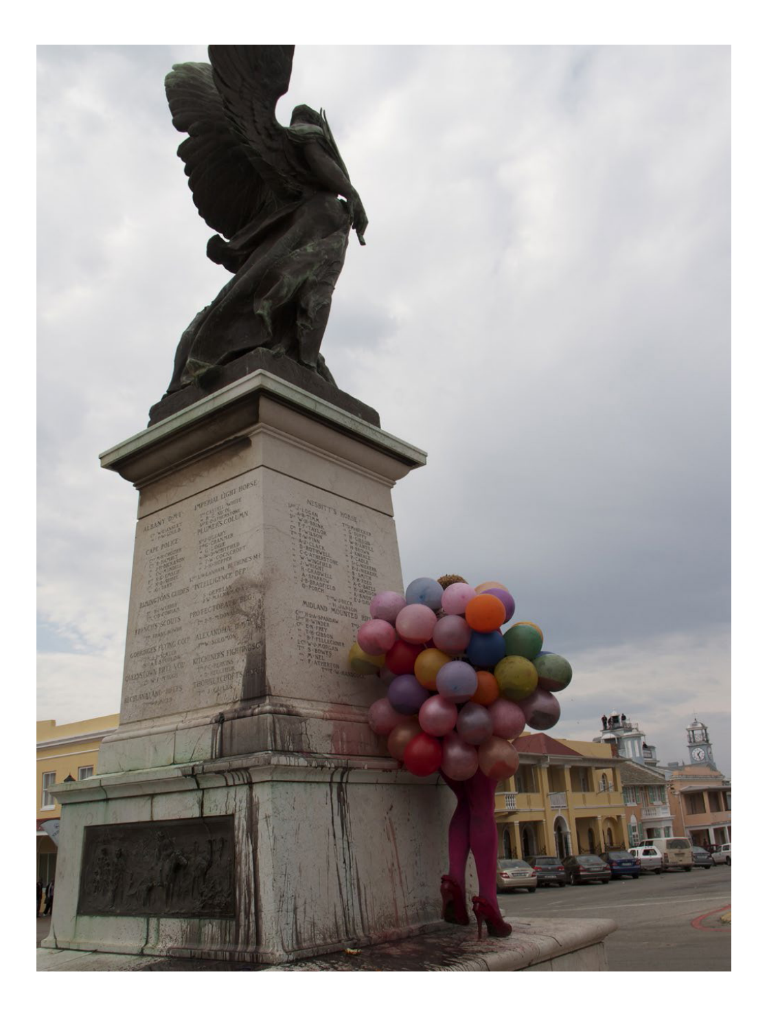
FIGURE Nº 1

The FWWOA (Future White Women of Azania) Intervention on the Anglo-Boer War Memorial, eMakhanda, 2012. Archival Inkjet print.