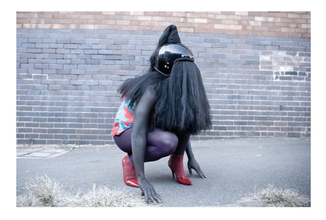
FIGURE N^0 4

Athi-Patra Ruga, The naivety of Beiruth # 1 , 2007, Lightjet print. 74 X 107 cm. Courtesy of the Artist and WHATIFTHEWORLD. Photo Credit: Chris Saunders.