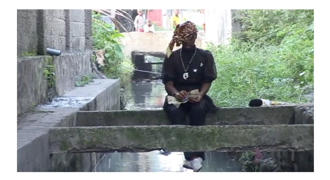
FIGURE N^0 3

The notion of commingling the cherished and the filthy is not a new discursive exercise. To mobilise camp as a critical inquiry with a political agenda, I scratch around in the shadowy depths of western discourse that wears the same skepticism as Ruga's avatars. In the 1933 psychoanalytic text, Modern man in search of a soul , Carl Jung (2001[1933]:35) asks, '[h]ow can [one] be substantial if [one does] not cast a shadow?'. He continues that a 'dark side' is necessary too for a subject 'to be whole' (Jung 200:35). It is then one's shadow (both literally and metaphorically) that bears testament to our existence and constitutes complex and intricate bodies. It is the interplay of light and shade that fashions objects and figures in volume. While I do agree with