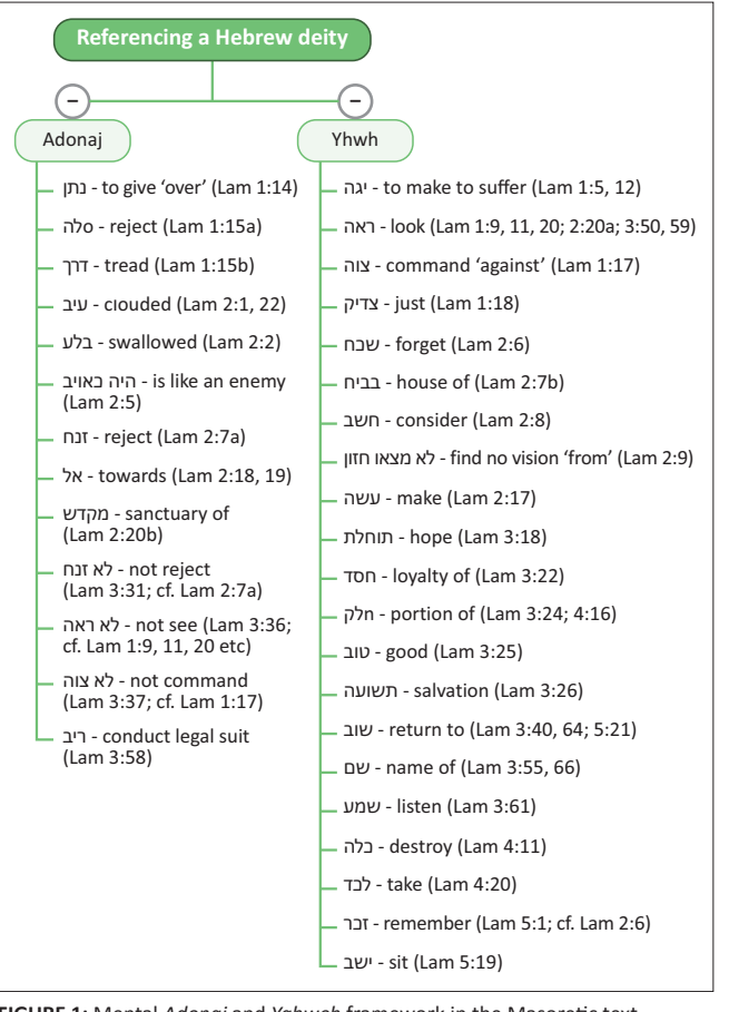
FIGURE 1: Mental Adonaj and Yahweh framework in the Masoretic text.

a 'house' is dedicated to Yahweh (Lm 2:7b). 'Verbal expression' – as a concept of 'calling out to' is directed at Adonaj (Lm 2:18, 19),<sup>24</sup> whereas to 'direct | align oneself' – to submit to, or to direct oneself is associated with both Adonaj (Lm 1:14) and Yahweh (Lm 3:40, 64; 5:21). 'Destruction' – the concept of having power to destroy – lies with both Adonaj (Lm 2:2) and Yahweh (Lm 4:11). If this includes an act of 'treading' or 'trampling', it again applies to both Adonaj (Lm 1:15b) and Yahweh (4QLam 1:15b). The Masoretes, however, do not ascribe the act of treading and trampling to Yahweh , but for them the concept of 'salvation' is exclusive to Yahweh . Inferred from these mental or conceptual frameworks, it will be difficult not to accept that both Yahweh and Adonaj are equally capable of operating within the earthly domain and that they are conceptually integrated for the most part.