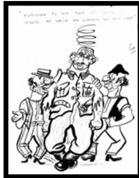
Figure 5 (left): “Make your minds up!” Division in Italy on who to support – Allies or Axis.