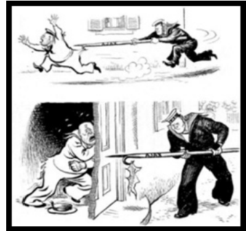
Figure 3 (left): “Something seems to have gone wrong: we should be at Victory now.”