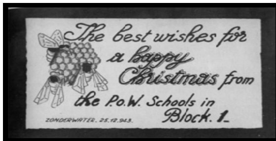
Figure 2: Christmas card made by Italian POW for Zonderwater staff

In later months, these attitudes were expressed in actions. For example, some South Africans and organised Afrikaner groups such as the Ossewabrandwag helped Italian POWs escape from camps and hid them. In other cases, aid was given to families of political detainees because they were often the breadwinners, and their families were destitute. 50 There were also Italians who found themselves without employment and without friends; they were shown respect by other civilians when they were released from internment. However, fraternisation could bring consequences. When a South African soldier in Koffiefontein showed sympathy or kindness towards an Italian internee he was immediately replaced, for example in the case of Major Donkin. Christmas cards (see Figure 2), made by Italian POWs were sent to officers and staff of the camp. 51 This gives the impression that by late 1943 some level of friendship had developed between Italian POWs and South Africans posted there. It seems that domestic attitudes towards Italian residents wavered between hostility and sympathy. The government's attitude, however, was explicit: the Italians were the enemy. 52