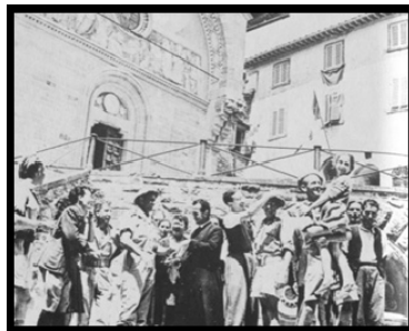
Figure 7: Italians and South Africans celebrating Italy’s new war status

A sense of camaraderie also developed between Italian guards of POW camps and their inmates. Crompton describes his interaction with officers and guards in a camp on the eve of Italy’s surrender, when an officer “touched me on the arm, and from behind a large grin exclaimed, ‘It won’t be long now’”. Similar anecdotes appear in Crompton’s memoirs of