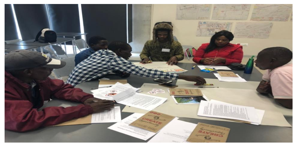
Figure 1: Community researchers from the Soweto-on-Sea community in Nelson Mandela Metropolitan Municipality prepare their maps for the transect walks.

CEP had developed a CPAR workbook<sup>3</sup> with learning material and basic research protocols for community-based participatory action research. A preparatory phase started with the community research team working through the learning material together and using it to plan different transect walks guided by interests and questions that smaller groups among the research team defined (see Figure 1). The groups were voluntarily formed and would self-organise. Sometimes groups of women or youth formed, but most often, the groups formed based on combining people who lived in the area with people bringing an outsider view.