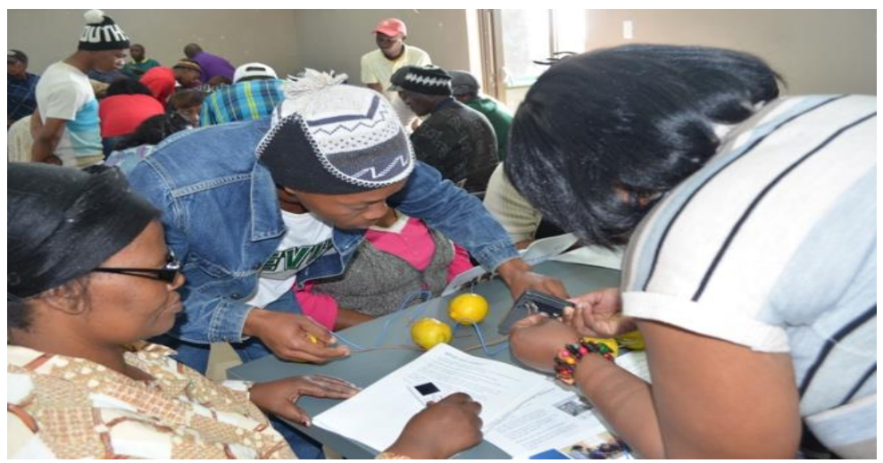
Figure 7a: Learning how an energy circuit is set up using a lemon

They also participated in small group activities that mirrored the CEP's own learning journey by using the energy workbook (see Figure 7d) and by conducting experiments with a lemon battery to learn how an energy circuit is set up (see Figure 7a). The group constructed and used workshop sets with small lights to set up an energy circuit connected to a standard battery and to experience safely what happens to an electrical wire when there is an overload (see Figure 7b). They also explored other sources of energy, for example, making a light work through generating kinetic energy and boiling water with a home-made rocket stove, which uses small sticks of wood as fuel.