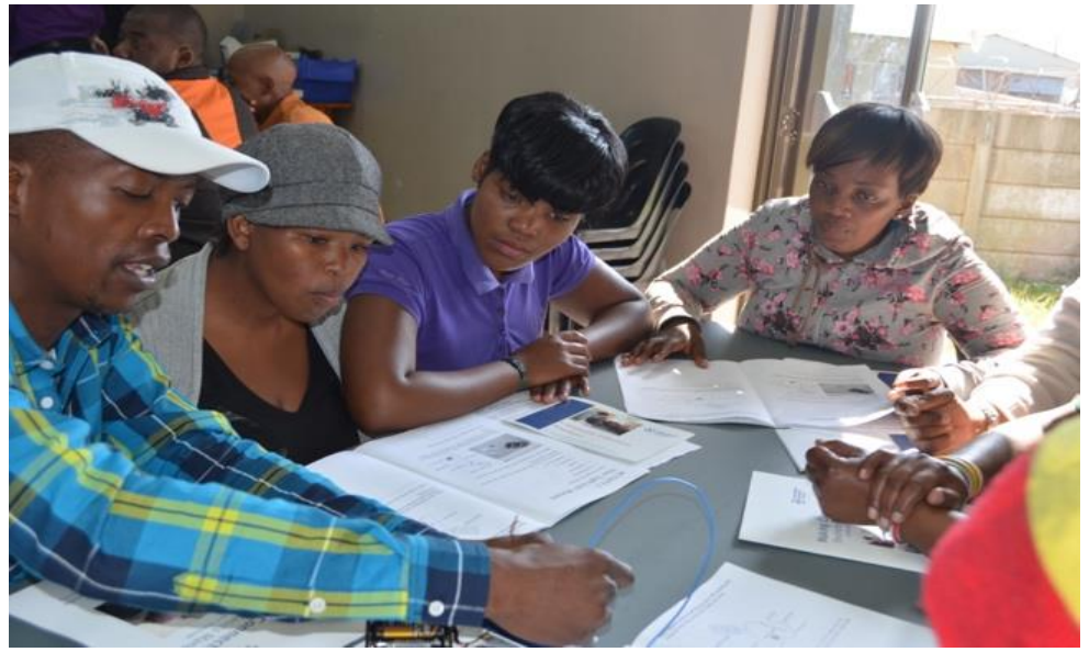
Figure 7d: Energy justice workshop experiments and learning

Throughout the process community members generated their own questions to apply their new knowledge. Asking why their pre-paid electricity is used up quickly, some members calculated the ampere hours appliances in their household use. A young man in one group expanded the lemon battery activity and connected five lemons in an electrical series, creating more than 1.5 volts of battery power. He then successfully used this to power his hand-held calculator (see Figure 7c). Delighted with his