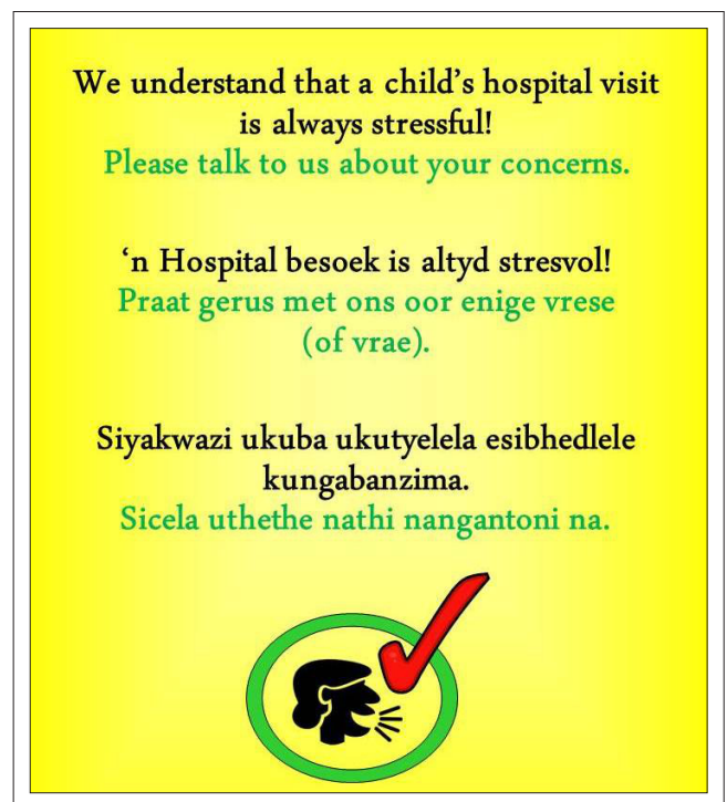
FIGURE 2: Signage example.

Data gathering during the rapid appraisal was done by three operational team members who administered the family questionnaires wearing unidentifiable, casual clothing; they approached as many family respondents as possible