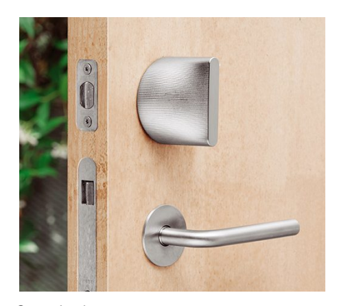
Figure 4: Friday Smart Lock

Other products include light fittings, furniture, accessories, porcelain ware, bathroom ware, cycling accessories, and vases (BIG ideas, [n.d.]). These items can be ordered online from its website.