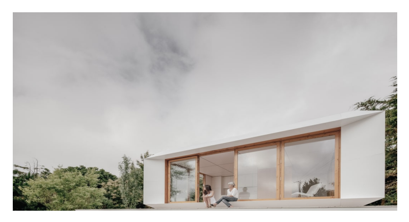
Figure 5: MIMA House (Vienna)