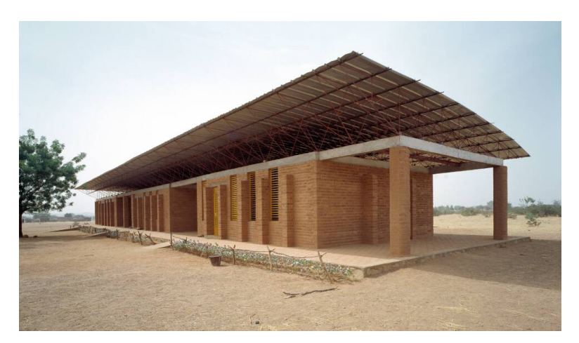
Figure 10: Gando Primary School. Photo by Simeon Duchoud Source: KéréArchitecture, [n.d.]: online