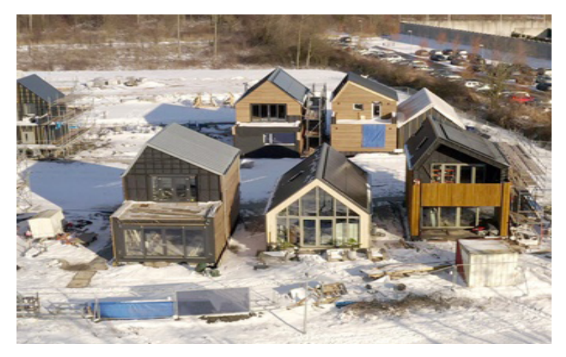
Figure 7: De Stripmaker, Almere, built using Wikihouse panels