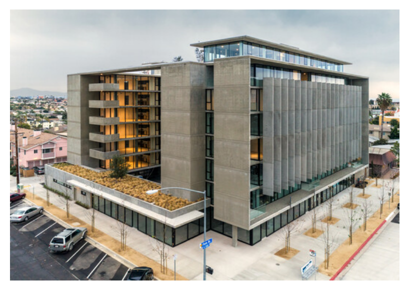
Figure 8: Park and Polk, San Diego (2018).