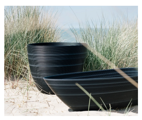
Figure 13:3D-printed planters designed by House of DUS

Aectual allows designers to produce bespoke designs at any scale for any building. The firm produces personal and architectural products with their large-scale, three-dimensional printing facility. Furthermore, they sell design and architectural products such as the 3D-printed planters (see Figure 13 – via their website (Aectual, [n.d.]).