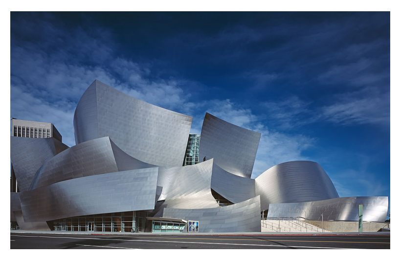
Figure 2: Walt Disney Concert Hall in Los Angeles (2003)

Frank Gehry established his practice in Los Angeles, California, in 1962 (Gehry Partners LLP, [n.d.]). Gehry's work is renowned for his incorporation of complex shapes such as those used in his Walt Disney Concert Hall (see Figure 2). The firm is regarded as one of the most influential practices of our day and Gehry is viewed by some as the world's most famous living architect (Architect, 2014).