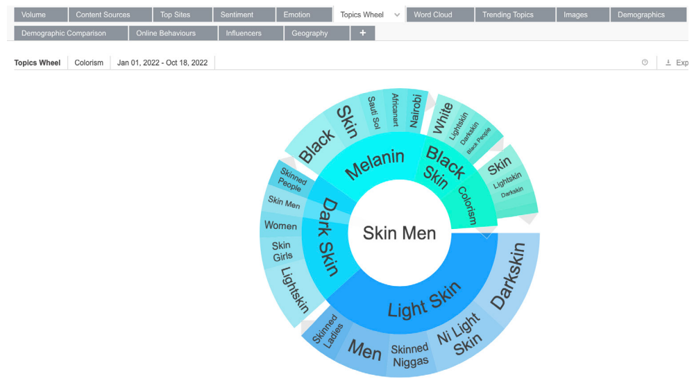
Figure 3: Colourism topic wheel