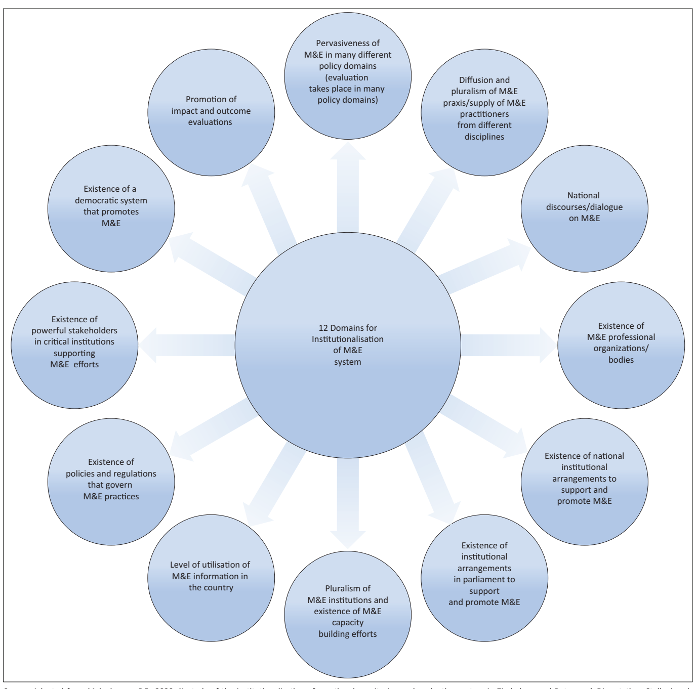
Source: Adapted from Makadzange, P.F., 2020, 'A study of the institutionalisation of a national monitoring and evaluation system in Zimbabwe and Botswana', Dissertation, Stellenbosch University, viewed n.d., from https://scholar.sun.ac.za/bitstream/handle/10019.1/109097/makadzange_study_2020.pdf M&E. monitoring and evaluation