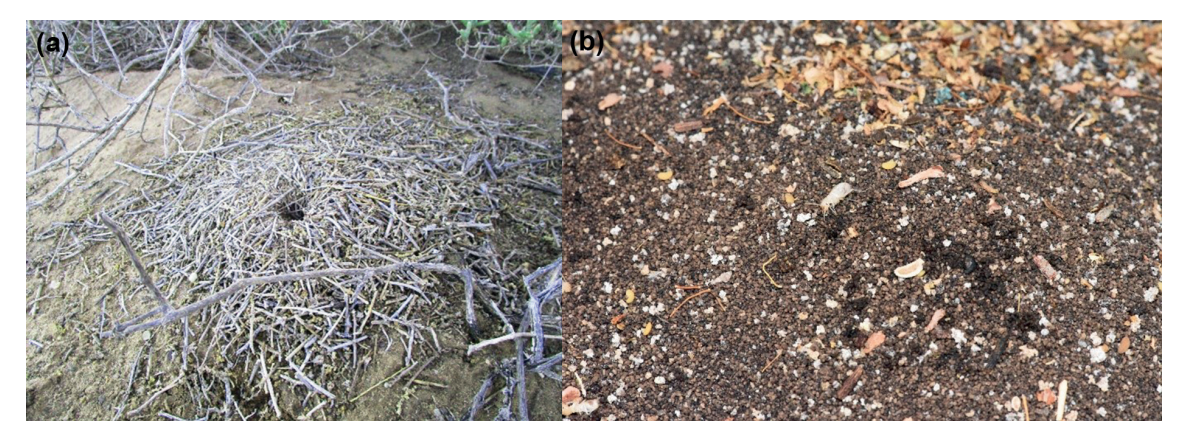
Figure 3. A foraging portal of Microhodotermes viator with unretrieved old food (a) and an ejecta portal with dark fresh frass and debris and termites (b)

and the spiders immediately surface after termites have been introduced into their containers (Dippenaar-Schoeman et al. 1996a). In the field, their presence near foraging holes apparently enables them to detect termite foraging activity, perhaps through soil vibrations or chemical cues. Wilson and Clark (1977) have shown that A. daedalus can detect termite activity throughout a 24-hour period in the field and that the spiders adapt their activity pattern to that of H. mossambicus . The same may be true for Tierberg with Ammoxenus foraging for M. viator .